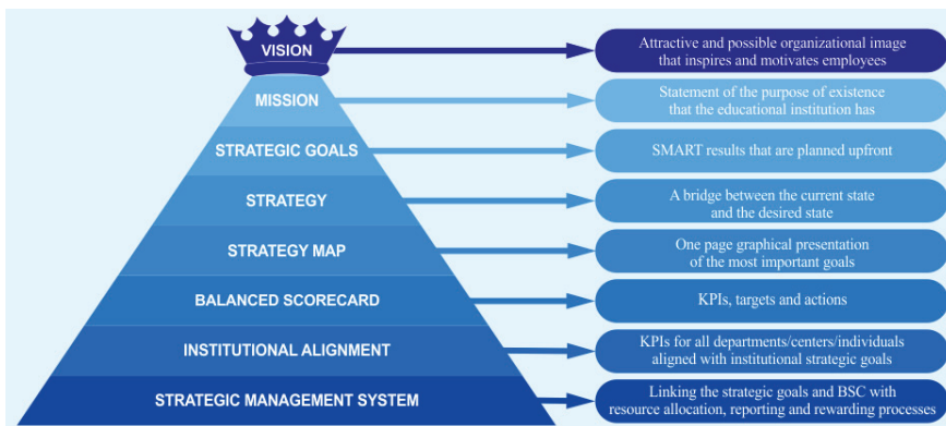
Figure 1: Process of designing the BSC system for Macedonian HEIs

Various authors in this area suggest many processes with different number of phases for designing and implementing the BSC system. However, most of them use similar sequence of phases or activities that consist this process. As a result of analyzing numerous practical and theoretical processes, we suggest specific process of creating the Balanced Scorecard system applicable in Macedonian HEIs (see Fig. 1). Phases are divided into two groups: phases of designing the BSC system and phases of implementing the BSC system.